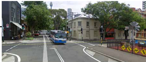
Cathedral St - Local Street Retained