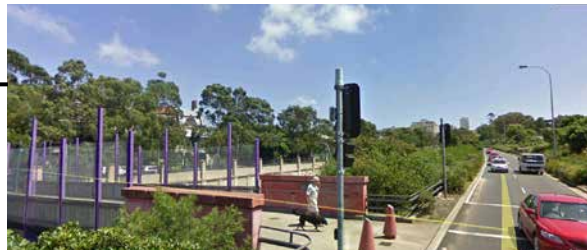
Moore Park Linked (Reality)