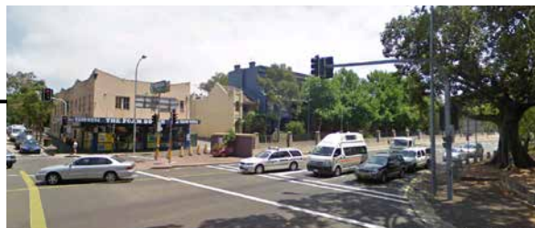
Cleveland St - Trees Retained

Retaining the local Community networks of paths, local streets and local public transport.