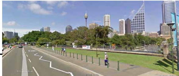
Art Gallery Bridge